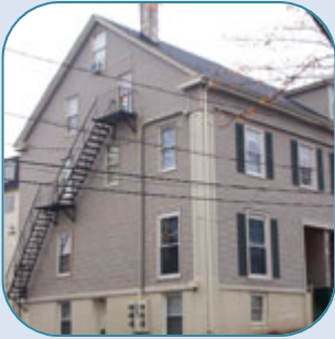
15 Hanover St, Portland 4 Unit Sold Date: February, 2009