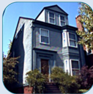
52 State St, Portland 3 Unit Sold Date: June, 2005