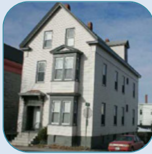
121 Cumberland Ave, Portland 3 Unit Sold Date: October, 2004