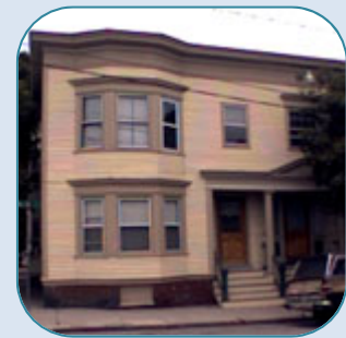
61-65 Wilson St, Portland 5 Unit Sold Date: August, 2007