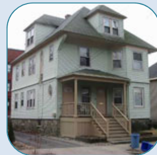
10-12 Crosby St, Portland 3 Unit Sold Date: December, 2007