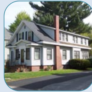
40 Oak St, Westbrook 2 Unit Sold Date: May, 2007