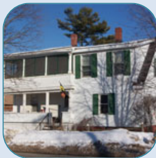
34 Saco St, Westbrook 2 Unit Sold Date: March, 2005