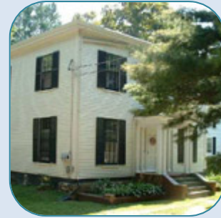
499 Ocean Ave, Portland 2 Unit Sold Date: October, 2008