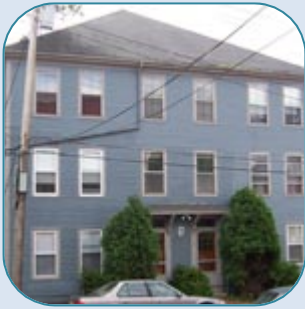
70-72 Newbury St, Portland 7 Unit Sold Date: March, 2007