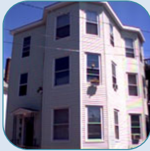
43 O'Brion St, Portland 6 Unit Sold Date: December, 2007