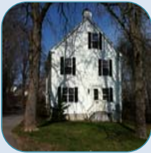
21 South Grafton St, Portland 2 Unit Sold Date: April, 2010