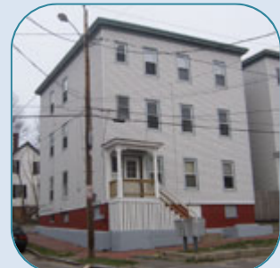
39-41 Greenleaf St, Portland 7 Unit Sold Date: November, 2007