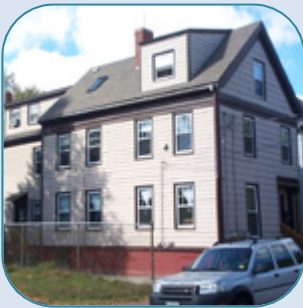
92 Clark St, Portland 3 Unit Sold Date: April, 2010