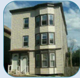
22 Madison St, Portland 4 Unit Sold Date: September, 2004