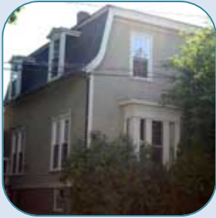
12 O'Brion St, Portland 4 Unit Sold Date: May, 2007