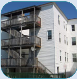
16-18 Wentworth St, Biddeford 6 Unit Sold Date: October, 2007