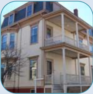
22 Howard St, Portland 3 Unit Sold Date: December, 2006