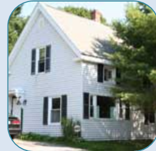
101 Allen Ave Ext, Portland 2 Unit Sold Date: July, 2007