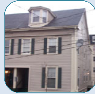
11 Hanover St, Portland 2 Unit Sold Date: February, 2009