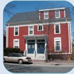
259 Brackett St, Portland 6 Unit Sold Date: August, 2006