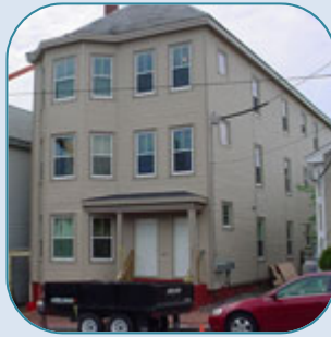
201 Congress St, Portland 3 Unit Sold Date: December, 2008