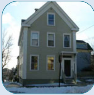
18 North St, Portland 3 Unit Sold Date: June, 2007