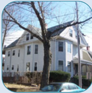
54-56 Pitt St, Portland 2 Unit Sold Date: March, 2008