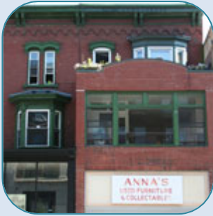
612 Congress St, Portland 5 Unit Sold Date: June, 2007