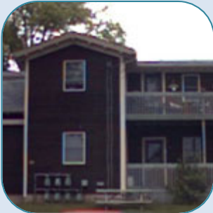
10 Adelaide St, Portland 6 Unit Sold Date: April, 2005