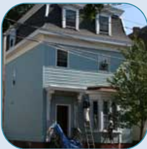
254 Spring St, Portland 5 Unit Sold Date: February, 2007