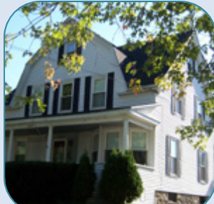
1638 Forest Ave, Portland 2 Unit Sold Date: August, 2004