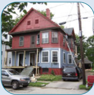
68-70 William St, Portland 2 Unit Sold Date: May, 2009