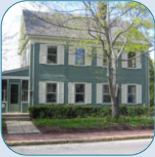
112 Elm St., Saco 2 Unit Sold Date: April, 2006