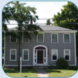
59 South St, Gorham 3 Unit Sold Date: February, 2008