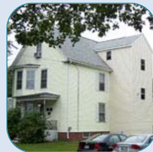
92-94 E. Kidder St, Portland 3 Unit Sold Date: November, 2005