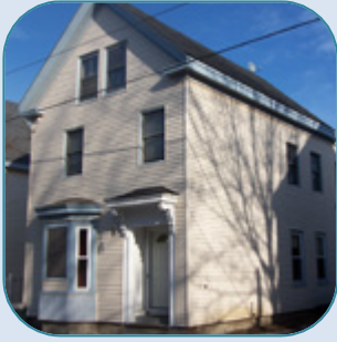
76 Wilson St, Portland 2 Unit Sold Date: May, 2008