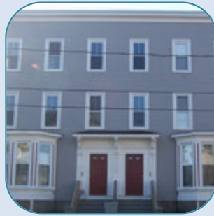
9 Saint Mary's St, Biddeford 7 Unit Sold Date: December, 2007