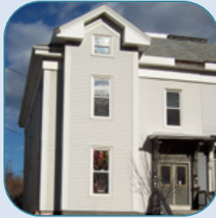
837 Congress St, Portland 4 Unit Sold Date: May, 2005