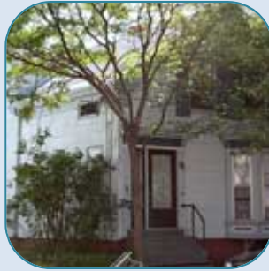
302 Brackett St, Portland 2 Unit Sold Date: January, 2007