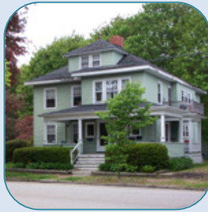
15 Longfellow St, Portland 2 Unit Sold Date: February, 2010