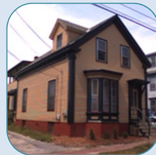
440 Saint John St, Portland 2 Unit Sold Date: August, 2005