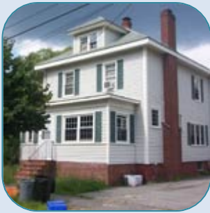
57 Walton Street, Portland 3 Unit Sold Date: September, 2008