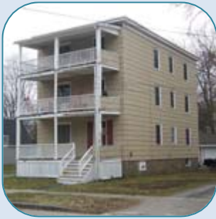
28 Saint George St, Portland 3 Unit Sold Date: March, 2009