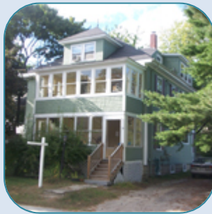
39 Cloudman St, Westbrook 3 Unit Sold Date: July, 2010