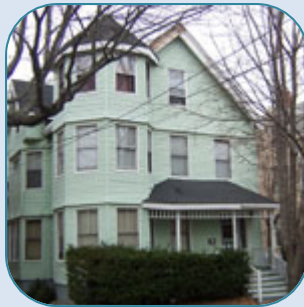
515 Cumberland Ave, Portland 5 Unit Sold Date: January, 2007