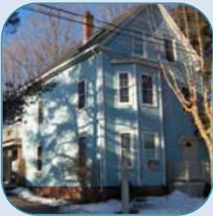
13 Knight St, Portland 2 Unit Sold Date: April, 2005