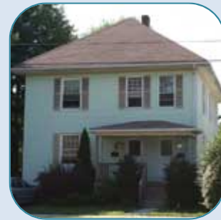
80 Columbia Rd, Portland 2 Unit Sold Date: March, 2007