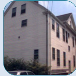
52 Bramhall St, Portland 3 Unit Sold Date: August, 2005