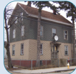
83 Anderson St, Portland 2 Unit Sold Date: May, 2006