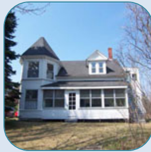
1958 Washington, Portland 2 Unit Sold Date: July, 2008