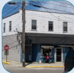
48 Alfred St, Biddeford 8 Unit Sold Date: July, 2007