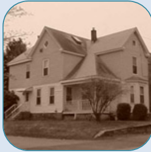
22 Maple St, South Portland 2 Unit Sold Date: June, 2005