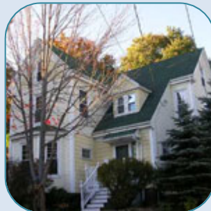
139-141 Ashmont St, Portland 2 Unit Sold Date: January, 2009