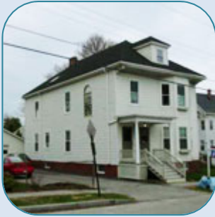
9-11 Sawyer St, Portland 2 Unit Sold Date: May, 2007