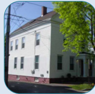
222 Danforth St, Portland 2 Unit Sold Date: June, 2009