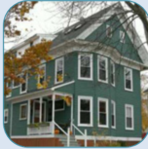
30-32 Elmwood St, Portland 4 Unit Sold Date: January, 2006