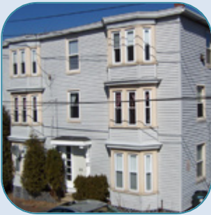
25 Brattle St, Portland 3 Unit Sold Date: February, 2007