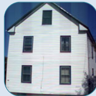
73 Cumberland Ave, Portland 2 Unit Sold Dates: July'06 & May '08