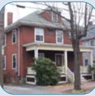
110 Dartmouth St, Portland 2 Unit Sold Date: March, 2010