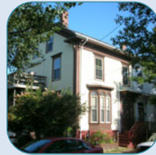
67 Quebec St, Portland 2 Unit Sold Date: May, 2009