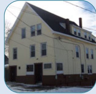
26 Everett St, Portland 4 Unit Sold Date: May, 2006