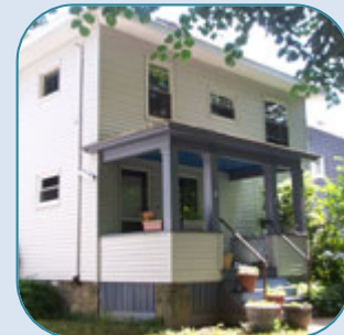
30-32 Belmeade Rd, Portland 2 Unit Sold Date: August, 2008