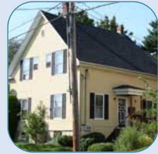
23-25 Walton St, Portland 2 Unit Sold Date: June, 2007