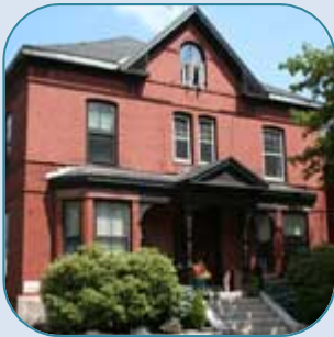
481 Cumberland Ave, Portland 4 Unit Sold Date: March, 2008