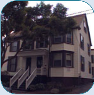
260-262 Brackett St, Portland 8 Unit Sold Date: August, 2006