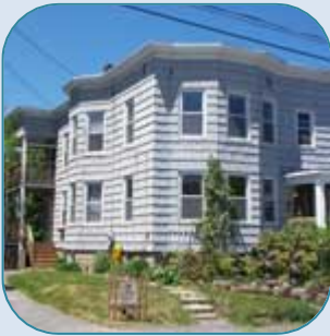
12 Mass. Ave, Portland 2 Unit Sold Date: September, 2008