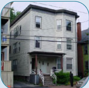
105 Grant St, Portland 3 Unit Sold Date: December, 2008