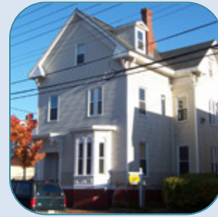
130 Cumberland Ave, Portland 3 Unit Sold Date: October, 2005