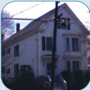
295 Allen Ave Ext, Portland 2 Unit Sold Date: December, 2004