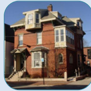
277 Congress St, Portland 4 Unit Sold Date: May, 2009