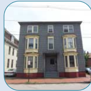
232 Spring St, Portland 4 Unit Sold Date: December, 2008