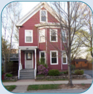
29 Payson St, Portland 2 Unit Sold Date: April, 2010