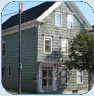
184 Congress St, Portland 2 Unit Sold Date: May, 2007