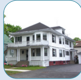
418-420 Woodford St, Portland 2 Unit Sold Date: September, 2009