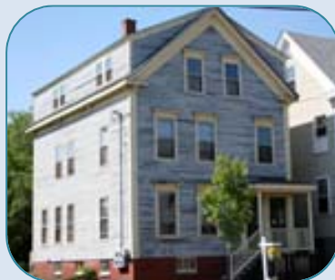
35 Cumberland Ave, Portland 3 Unit Sold Dates: July, 2010