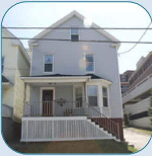
14 Boynton St, Portland 3 Unit Sold Date: Sept '08 & June '09