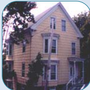
4 Gilman St, Portland 3 Unit Sold Date: April, 2005