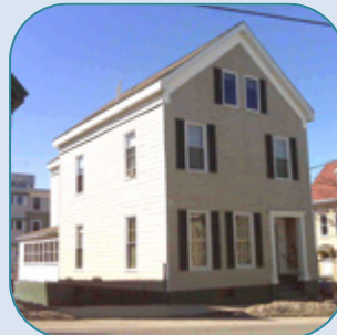
26 Anderson St, Portland 3 Unit Sold Date: December, 2009