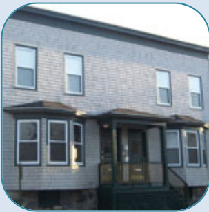
52-54 Moody St, Portland 2 Unit Sold Date: May, 2007