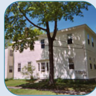
21 Church St, Yarmouth 4 Unit Sold Date: December, 2008