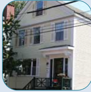
68 Winter St, Portland 2 Unit Sold Date: July, 2007