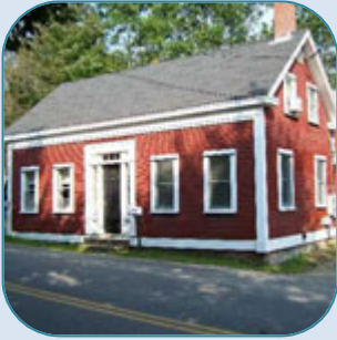
5 Green St, Topsham 3 Unit Sold Date: May, 2007