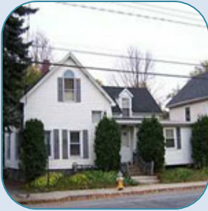
640 Main St, Westbrook 3 Unit Sold Date: September, 2009