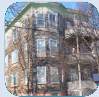
62 Whitney Ave, Portland 2 Unit Sold Date: July, 2008