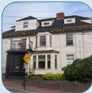
1-3 Crescent St, Portland 3 Unit Sold Date: June, 2009