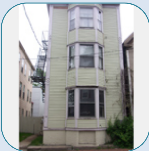
26 Dow St, Portland 4 Unit Sold Date: December, 2009