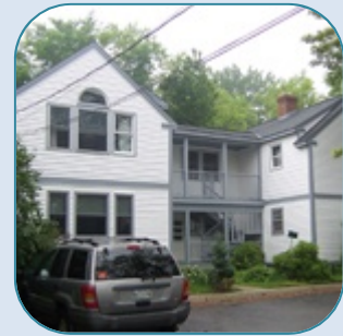
13 Middle St, Freeport 3 Unit Sold Date: October, 2006