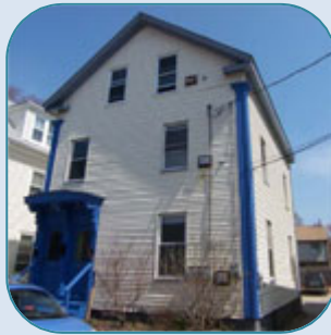
23 May St, Portland 3 Unit Sold Date: May, 2008