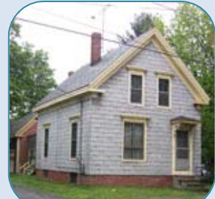
14 Frederic St, Portland 2 Unit Sold Dates: July '05 & Dec '06