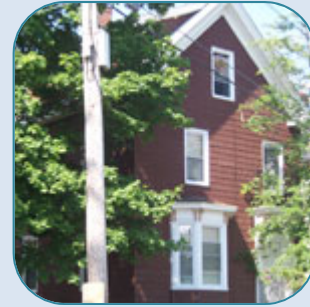
1040 Congress St, Portland 3 Unit Sold Date: February, 2008