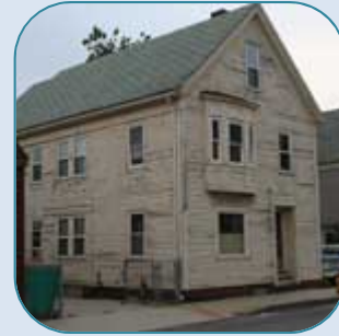
112 Sheridan St, Portland 2 Unit Sold Date: July, 2008