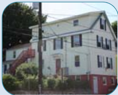
15 Cumberland Ave, Portland 5 Unit Sold Dates: May, 2010