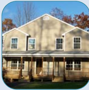
6 Carriage Ln, Portland 2 Unit Sold Date: October, 2006