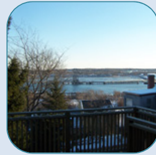
84 Salem, Portland 2 Unit Sold Date: March, 2006