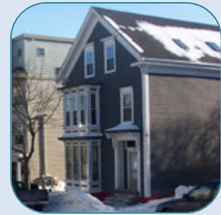
40 Waterville St, Portland 2 Unit Sold Date: May, 2009