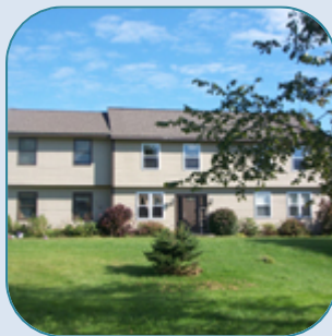
47 Dow Rd, Gorham 2 Unit Sold Date: May, 2007