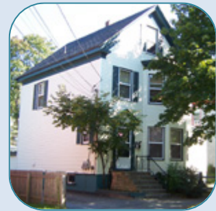
27 Nevens Ave, Portland 2 Unit Sold Date: December, 2004