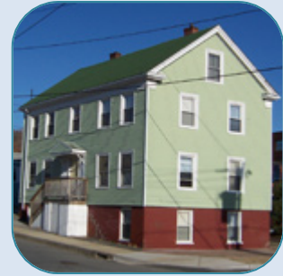
28 Marion St, Portland 3 Unit Sold Date: February, 2007