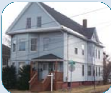
206 Deering Ave, Portland 2 Unit Sold Date: June, 2010