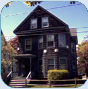
36 Lawn Ave, Portland 2 Unit Sold Date: June, 2005