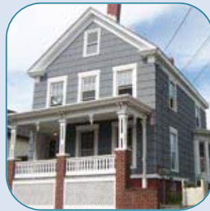
23 Lafayette St, Portland 2 Unit Sold Date: May, 2006