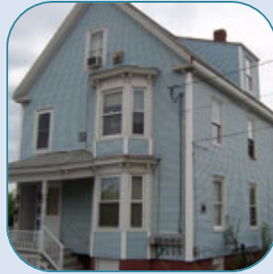
25 Hemlock St, Portland 4 Unit Sold Date: December, 2006