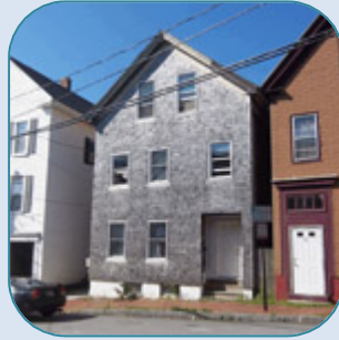
26 Hampshire St, Portland 3 Unit Sold Date: September, 2009