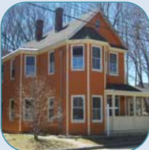
52 Ashmont St, Portland 2 Unit Sold Date: June, 2007