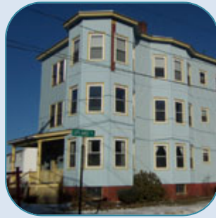
115-117 Veranda St, Portland 3 Unit Sold Date: November, 2008