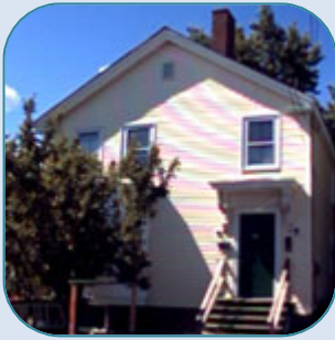
42 Tyng St, Portland 2 Unit Sold Date: October, 2004