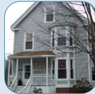
64-66 Lamb St, Westbrook 4 Unit Sold Date: Aug '05 & Jun '08