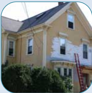
160 Coyle St, Portland 3 Unit Sold Date: February, 2007