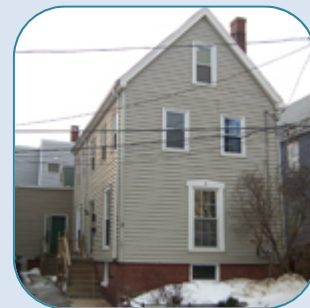
16 Tate St, Portland 2 Unit Sold Date: March, 2006