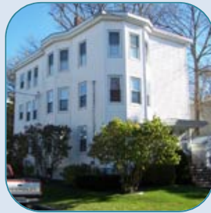
93-95 Illsley St, Portland 3 Unit Sold Date: June, 2007