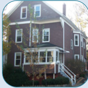
120 Sherman St, Portland 3 Unit Sold Date: June, 2006