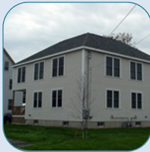
17 Morrill St, Portland 2 Unit Sold Date: June, 2005