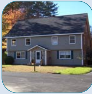
40-42 Bonython Ave, Saco 2 Unit Sold Date: March, 2007