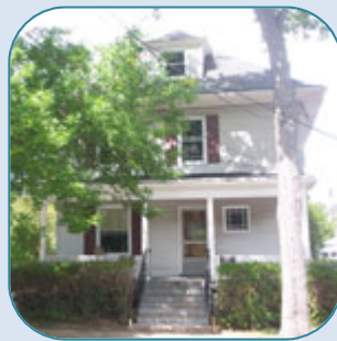
85 William St, Portland 3 Unit Sold Date: November, 2008