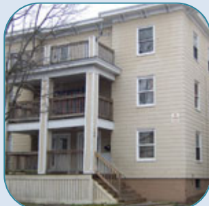
128-130 Grant St, Portland 6 Unit Sold Dates: Aug '07 & Oct '09