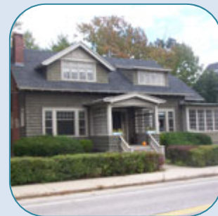
271 Deering Ave, Portland 2 Unit Sold Date: March, 2009