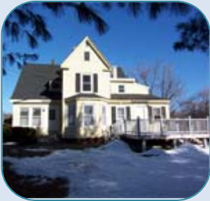
28 Fallbrook St, Portland 2 Unit Sold Date: April, 2010