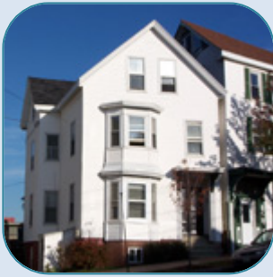
87 Cumberland St, Portland 3 Unit Sold Dates: Oct '07 & Jan '08