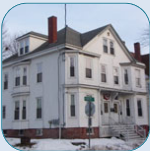
75-77 Roberts St, Portland 3 Unit Sold Date: July, 2008