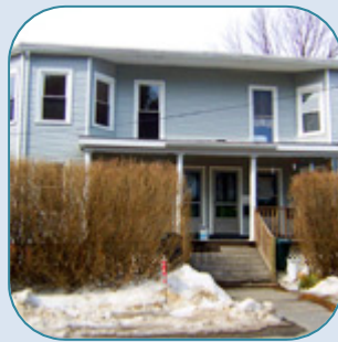
39-45 West Kidder St, Portland 4 Unit Sold Date: