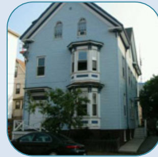
63 Kellogg St, Portland 3 Unit Sold Date: May, 2009