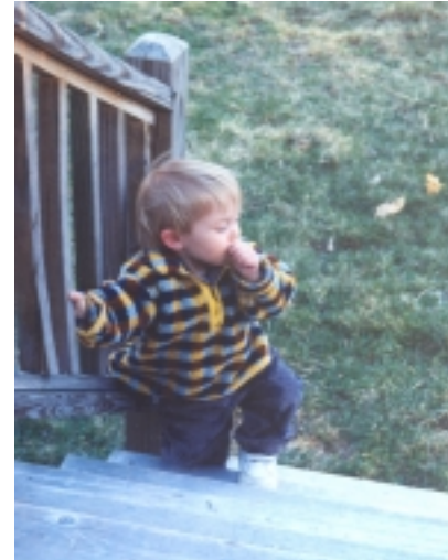
Children touching unsealed treated wood, and then putting their hands in their mouths is the biggest concern.

Too much arsenic can cause cancer. So it is good to prevent arsenic getting into your body when you can. When you touch wood treated with arsenic, you can get arsenic on your hands. The arsenic on your hands can get into your mouth if you are not careful about washing before eating. Young children are most at risk because they are more likely to put their hands in their mouths. The good news is that there are simple things you can do to protect yourself and your family from arsenic treated wood. This fact sheet will tell you how.