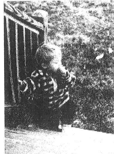
Children touching unsealed treated wood, and then putting their hands in their mouths is the biggest concern.

Too much arsenic can cause cancer. So it is good to prevent arsenic getting into your body when you can. When you touch wood treated with arsenic, you can get arsenic on your hands. The arsenic on your hands can get into your mouth if you are not careful about washing before eating. Young children are most at risk because they are more likely to put their hands in their mouths. The good news is that there are simple things you can do to protect yourself and your family from arsenic treated wood. This fact sheet will tell you how.